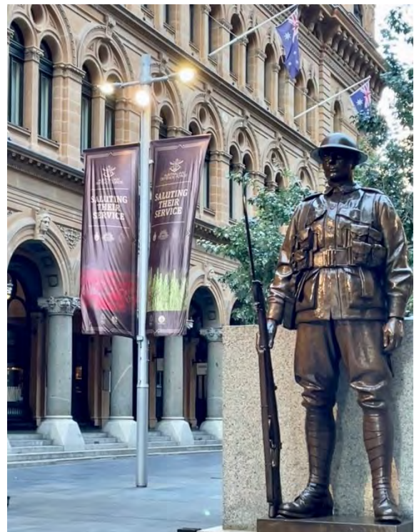
WW1 Memorial at Martin Place in Sydney