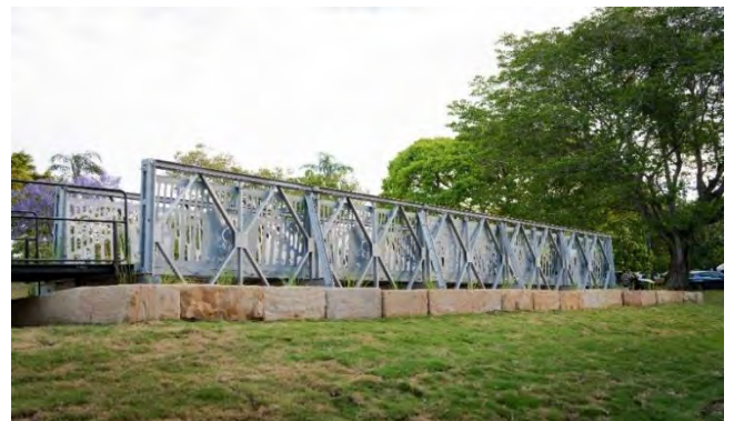
Bridge in ANZAC Park Toowong

Toowong Brisbane - This bridge was dedicated on 11 th November 2022 to coincide with the 120 th anniversary of the birth of the Corps of Royal Australian Engineers. It is a genuine Bailey military grade pedestrian bridge of 5 bays.