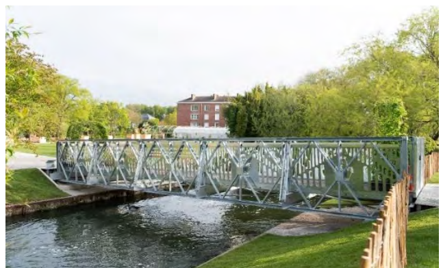
The Amiens Bridge of Friendship joining the Rue de la Resistance with the Jardin des Plantes.