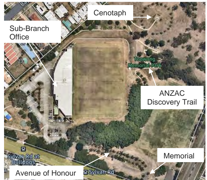
Toowong Memorial Park

Please note the office is only open at certain times so please contact us to make a time to meet.