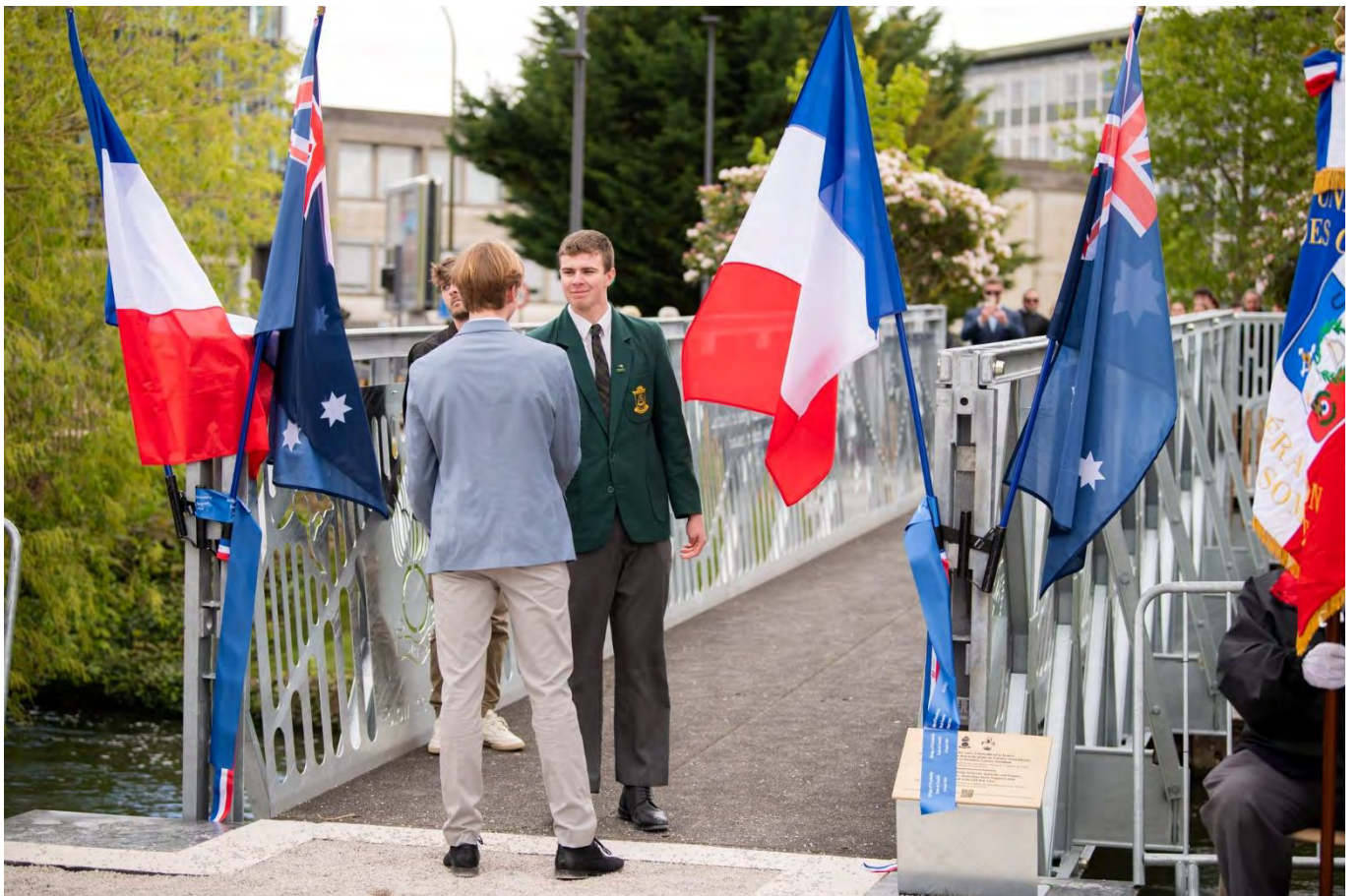
French and Australian school children shake hands