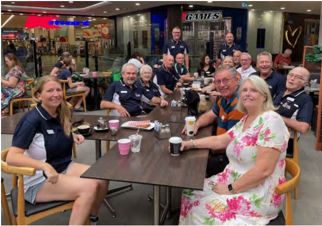
Sub-branch members at Chatterbox

Please come and enjoy a free coffee and get to know some of your fellow Toowong members.