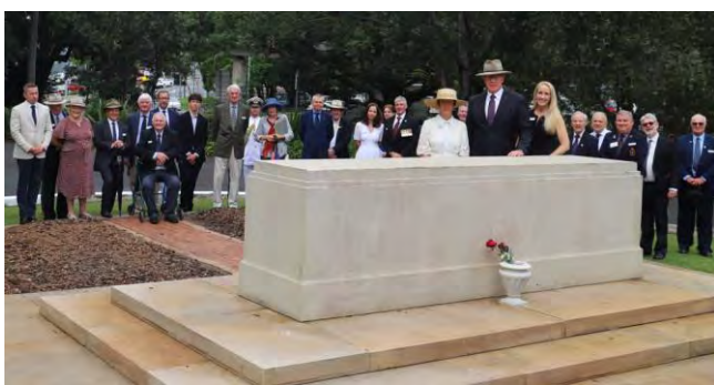
Stone of Remembrance Centenary service in Toowong Cemetery