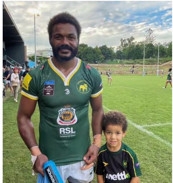
Toowong RSL sponsored rugby jersey