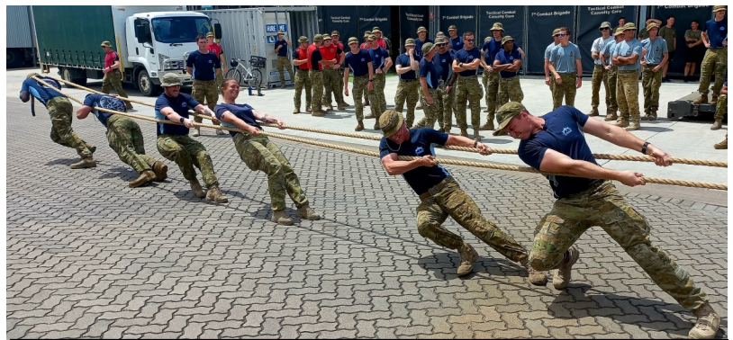
Mil Skills Comp – Truck Pull