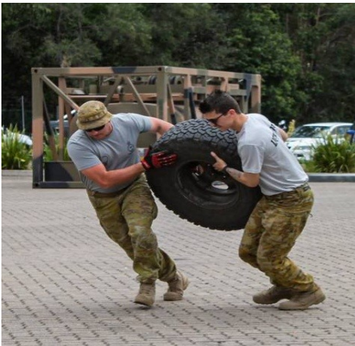
Mil Skills Comp – Tyre Change

The support requirements for Exercise Talisman Sabre meant the local birthday celebrations for our serving members were postponed until late October when a military skills competition for regional units and detachments was held at Enoggera. It was a thoroughly enjoyable event with soldiers from Amberley joining RACT detachments from Enoggera and the event hosts, 5 Tpt Sqn. At the end of the competition, it was a tie between Charlie Troop, 5 Tpt Sqn and the 2/14 LHR detachment. In the good-natured spirit of the event, a tie-break involving the consumption of hot dogs was decided upon. Charlie Troop prevailed in a tightly fought engagement!